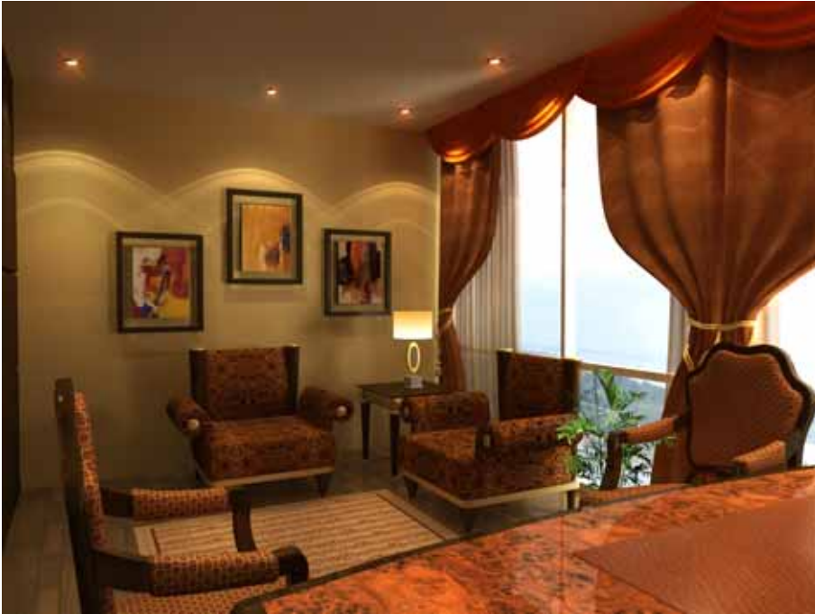
Media Office – Dubai Media city