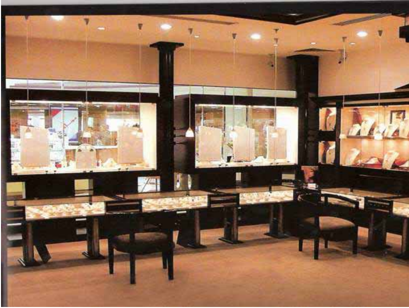
Jewelry Shop – Mall of the Emirates