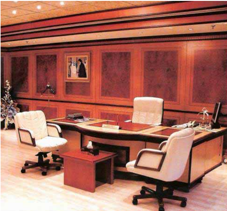
Private Office – DIFC