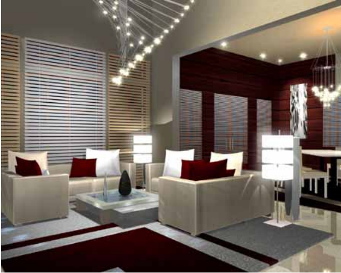
Private Villa – Jumeirah Islands