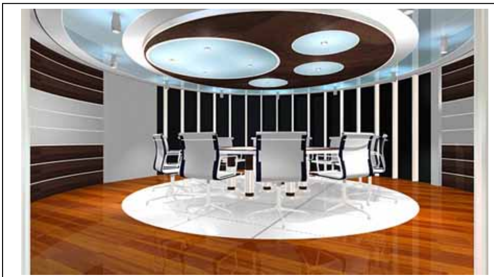
Dubai Outdoor Media – Al Qouz