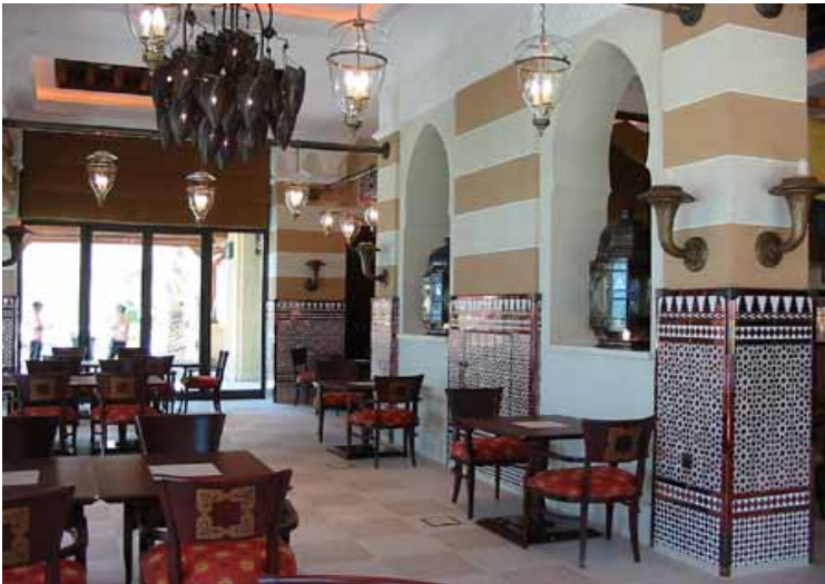
Mediterranean Restaurant- Madinat Jumeirah