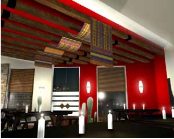
Mexican Indian Restaurant - Greens