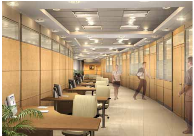
Corporate Interiors – Saud Bhavan Group