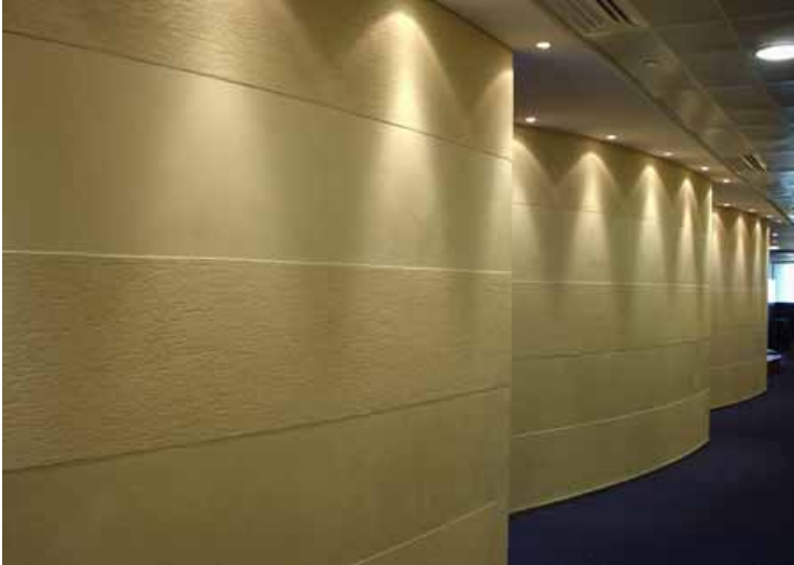
Barclays Bank – Dubai